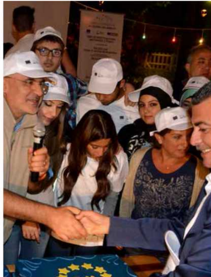
Project's event in Lebanon